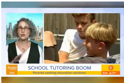
Worried your child has fallen behind? Try this new 1-1 tutoring service Cluey Learning